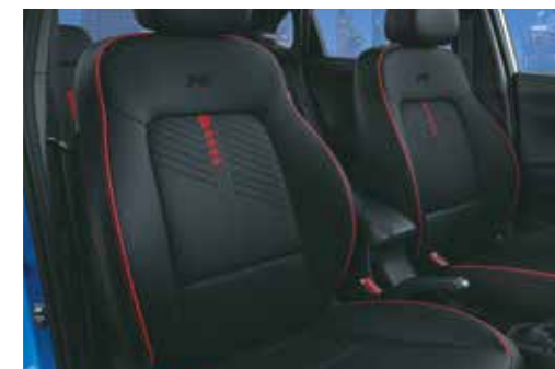
Chequered flag design leather* seats with N logo