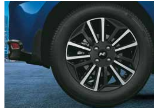
Rear disc brakes