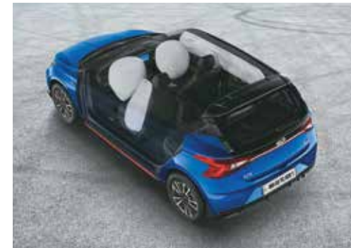
Driver, passenger, side & curtain airbags

Other features – 7-speed dual clutch transmission (7 DCT) | Intelligent manual transmission (iMT) | Automatic headlamps | ISOFIX | Emergency stop signal (ESS) | Hill assist control (HAC) | Electronic stability control (ESC) | Tyre pressure monitoring system (highline) | Rear parking sensors with display on infotainment