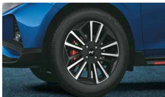
R16 (D=405.6mm) diamond cut alloy wheels with N logo and front disc brakes with red caliper

Other features – Athletic red highlights* (front skid plate & side sill garnish) | Sporty tailgate spoiler with side wings LED projector headlamps with LED day time running lamps (DRL) | Dark chrome connecting tail lamp garnish | Front fog lamp chrome garnish