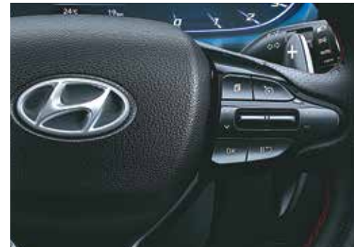
Paddle shifters (DCT only)