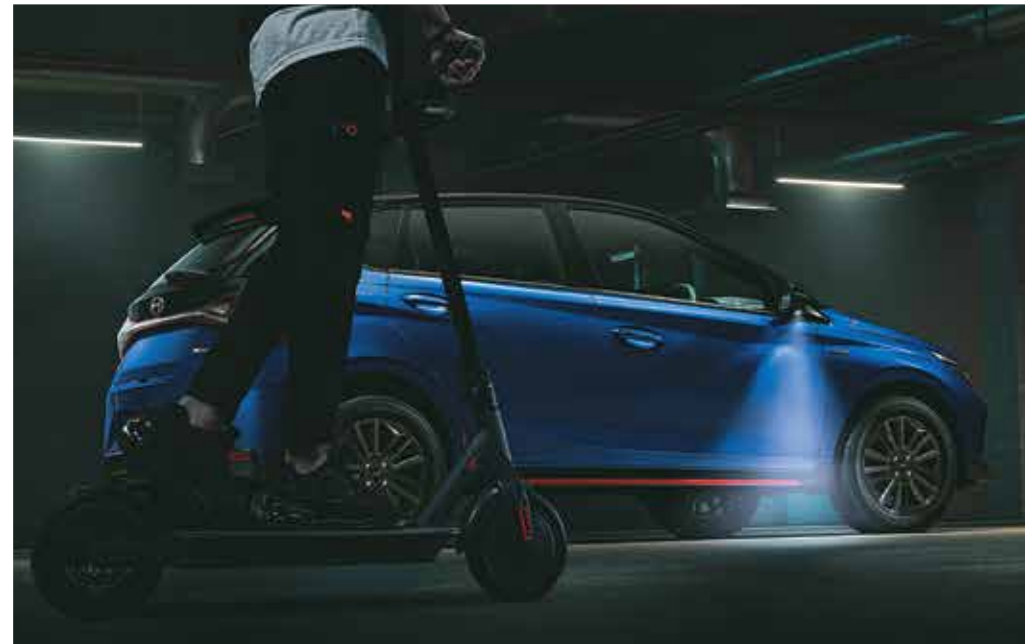
Puddle lamps with welcome function