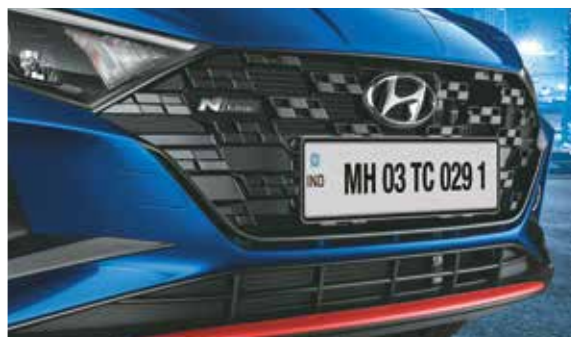
Chequered flag inspired front grille

Images are for creative purposes only. Please do not imitate. Hyundai encourages safe driving practices.