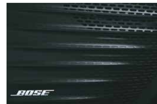
Bose premium 7 speaker system

Other features – Wireless charger with cooling pad | Digital cluster with TFT multi information display (MID) | Rear seat armrest