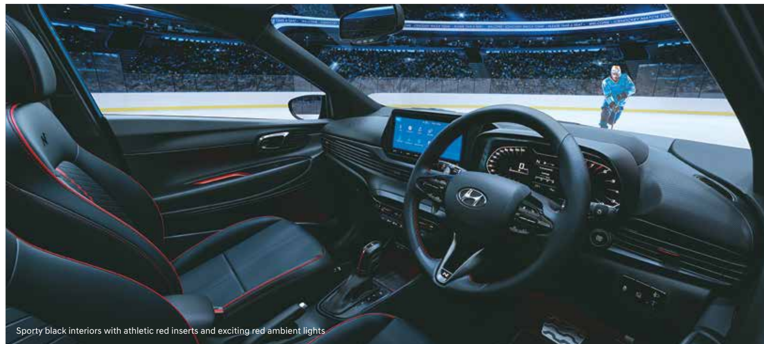
Sporty black interiors with athletic red inserts and exciting red ambient lights

Step inside the Hyundai i20 N Line to discover its fun and sporty side. The sleek design gives the prominent dashboard an unconventionally cool look.