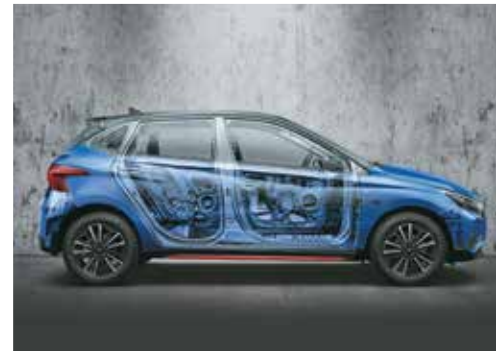
Strong body structure with AHSS & HSS