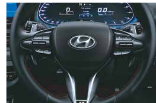
3-spoke steering wheel with N logo