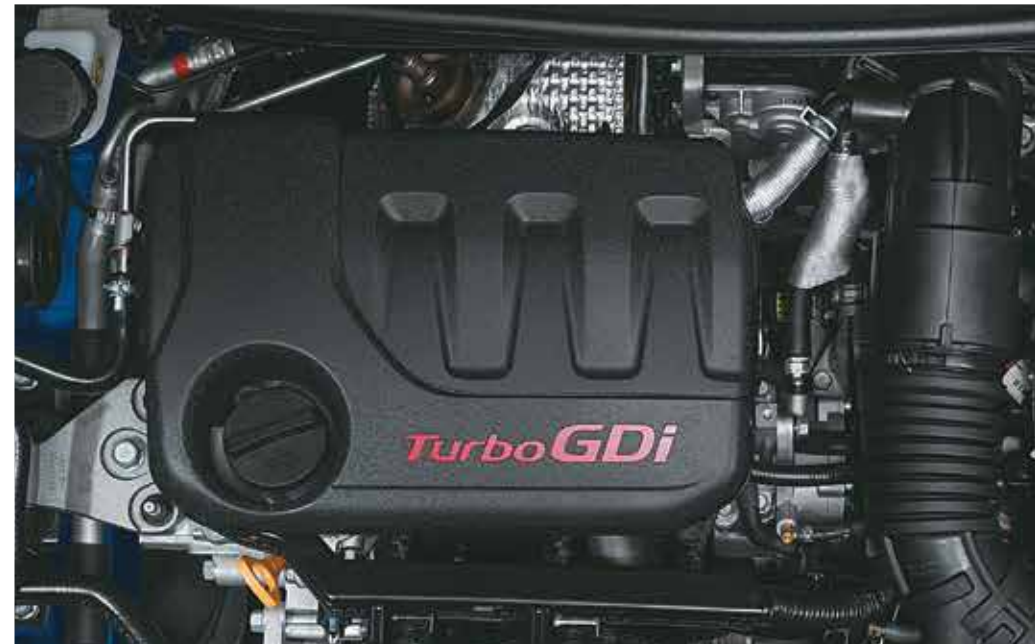
1.0 l Turbo GDI petrol engine with max. power of 88.3 kW (120 PS) / 6 000 r/min

With Hyundai's most advanced safety systems, this car is packed with the most comprehensive safety features and technology.