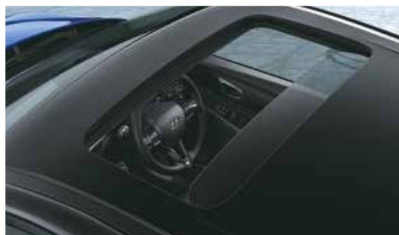
Voice enabled smart electric sunroof