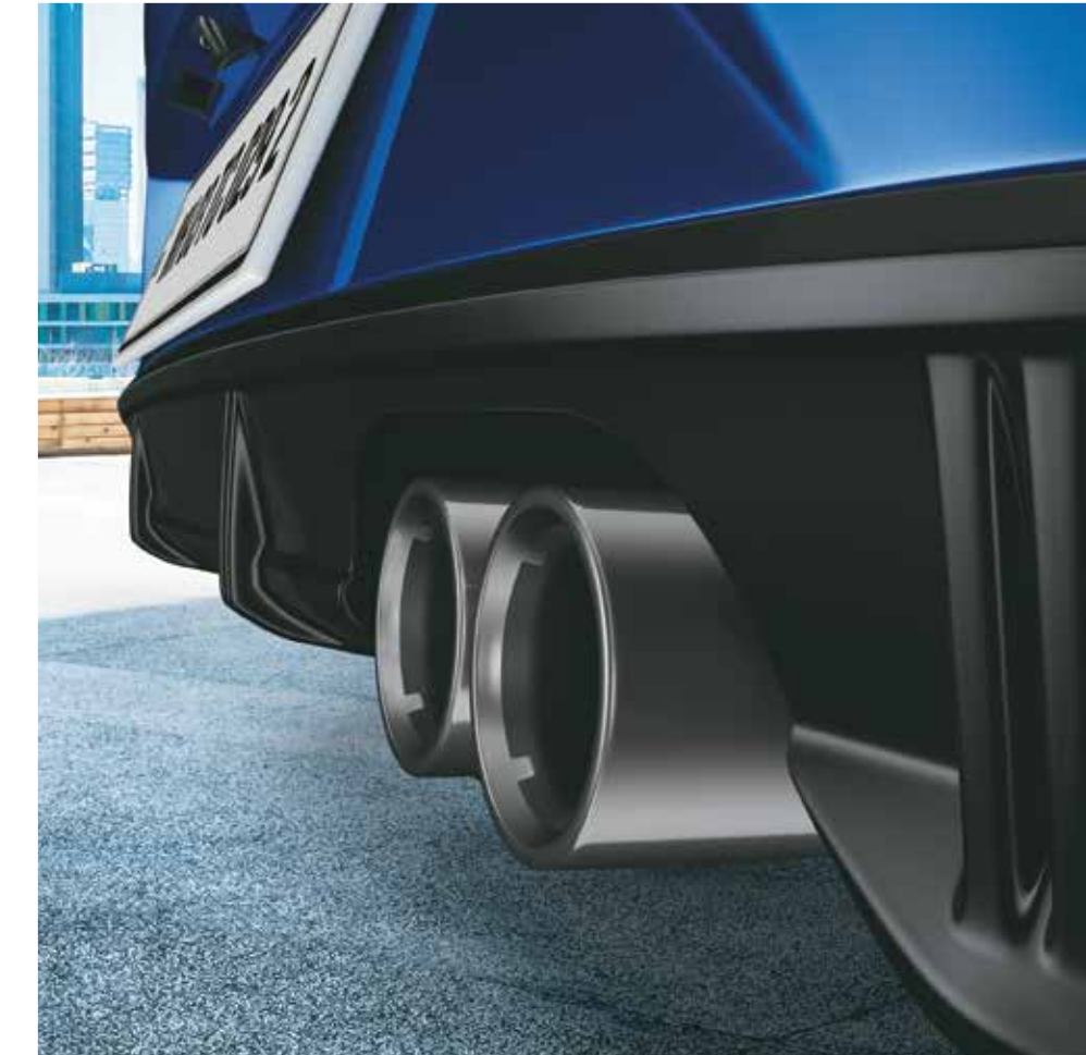
Twin tip muffler