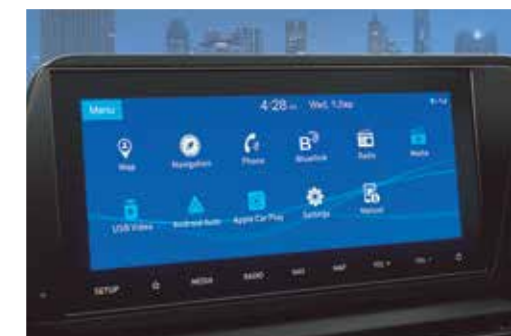
26.03 cm (10.25") HD touchscreen infotainment & navigation system