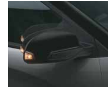
ORVM (heated) with electric adjust and folding