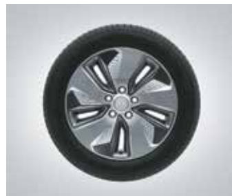
R17 (D=436.6 mm) EV exclusive alloy wheels