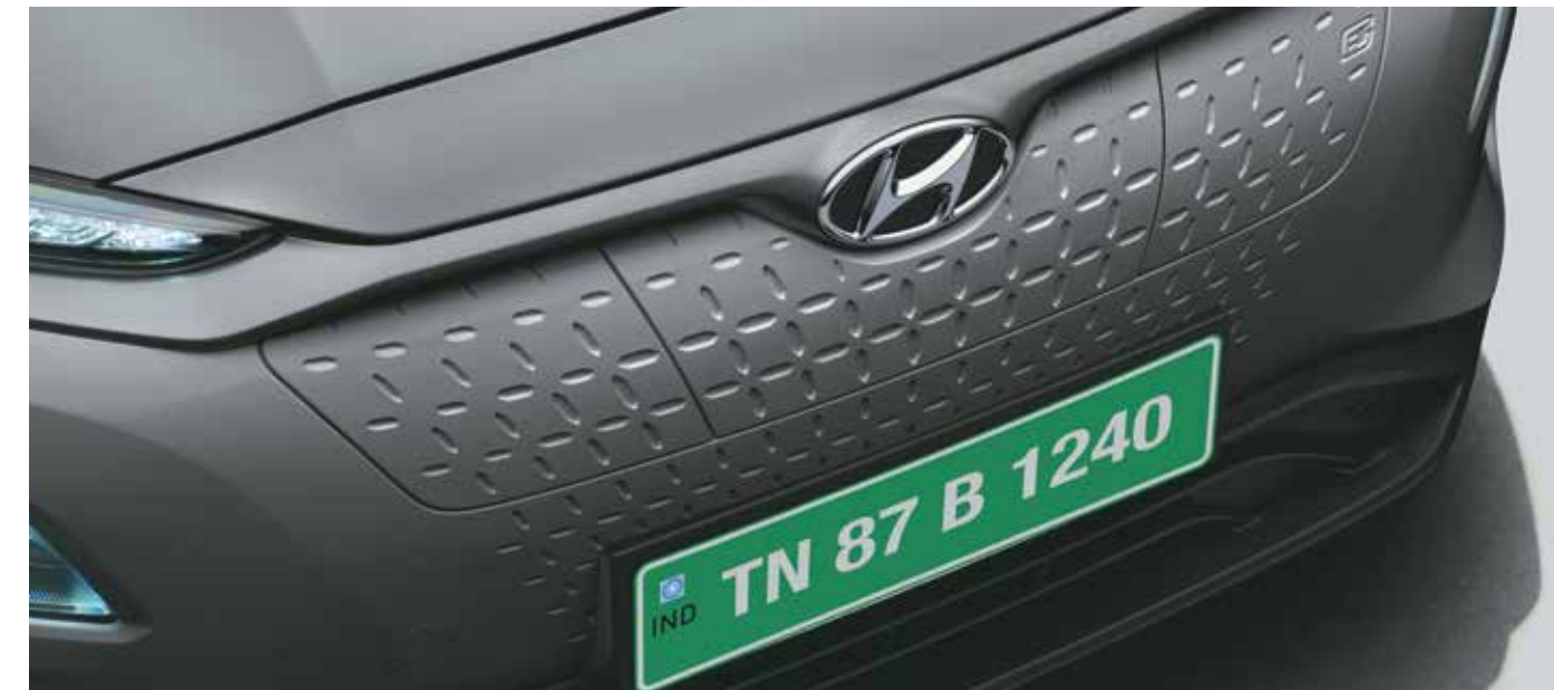
Modern, clean & integrated front grille design optimized for superior aerodynamics