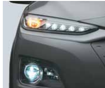
Distinctive split type LED headlamps with LED DRLs

Other features: Roof rails | Body color ORVM with turn indicators | Body colour door handles | Dual tone roof (option) | Smart electric sunroof with safety | Side sill molding – black