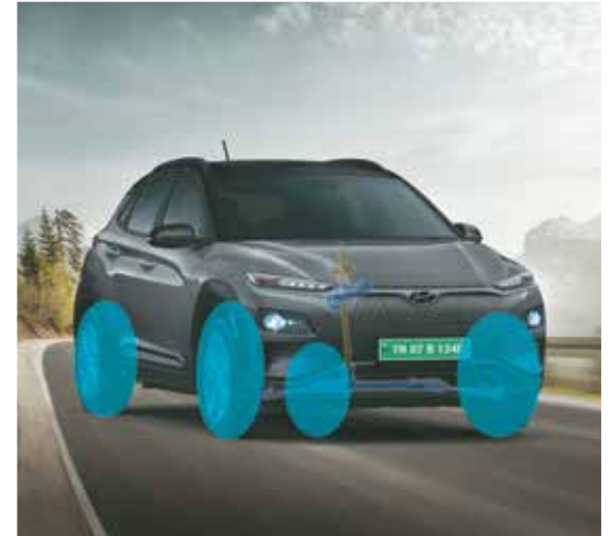
Vehicle stability management (VSM)